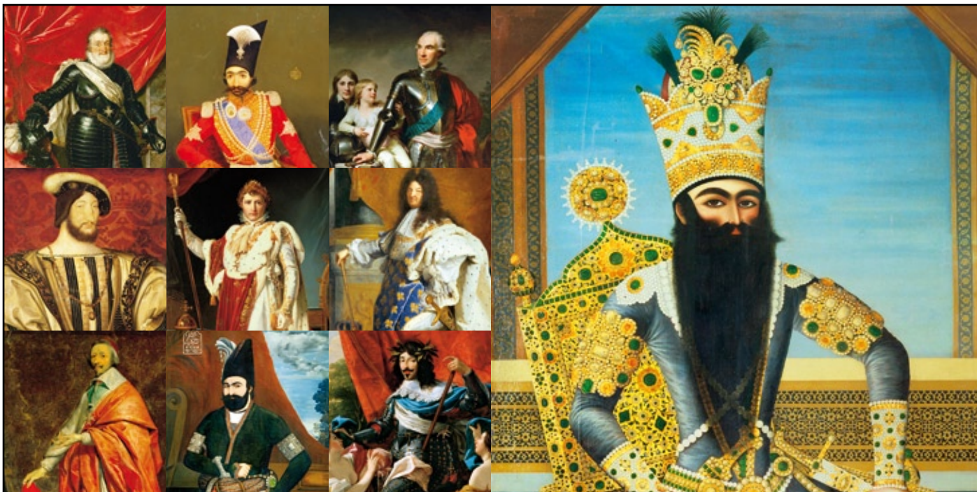
Pourbus. Frans the Younger (1569-1622) Henri IV, King of France Clouet. Jean (1480?-1540) François I, King of France Champaigne. Philippe de (1602-1674) Cardinal Richelieu